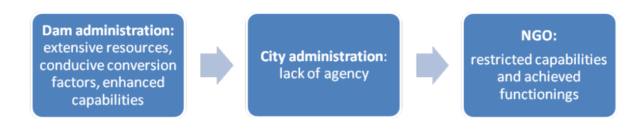
Figure 4: Mediating role of the city administration in the process of the NGO's capability formation

As the interview analysis suggests, the interrelations between the three key actors in the conflict allow interpreting the causal chain of events as follows. [1] Having vast financial resources at its disposal, the dam administration also enjoyed a number of favourable conversion factors which enhanced its freedoms to conduct technical flood protection almost without public participation. [2] The city administration, also affected by a number of conversion factors (such as the legal norms and current political conditions, elaborated for the dam administration and the NGO in Sections 5.1 and 5.2), demonstrated a lack of agency to decline the tree clearance measures or to propose substantial changes to the plans of the dam administration. [3] As an outcome, the NGO was not able to participate in deciding on the clearance measures or to bring in alternative suggestions. This situation resulted from the enhanced capabilities of the dam administration to follow its course of action but could have been changed by the city administration, had it actively intervened. This chain of events as following from the interview analysis is graphically presented in Figure 4.